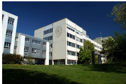
Göttingen University and the Geoscience Centre (GZG)