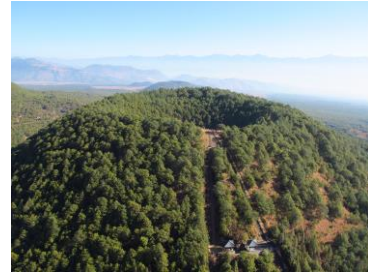
The volcanic crater in Tengchong

Day 3 (Aug. 18): Morning: Investigate the Ordovician sequence at Haidong section (paleogeographically the northern extension of the Indo-China paleoplate), and collect fossils of late Dapingian to Darriwilian age within the Xiangyang Formation at three academic stops, including brachiopods, trilobites, bivalves, graptolites, bryozoans, etc.