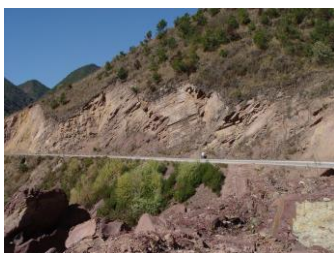
The Laojianshan Fm in Baoshan

Day 7 (Aug 22): Delegates depart for their own destinations.