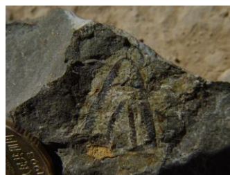
Graptolites from the Shihtien Fm