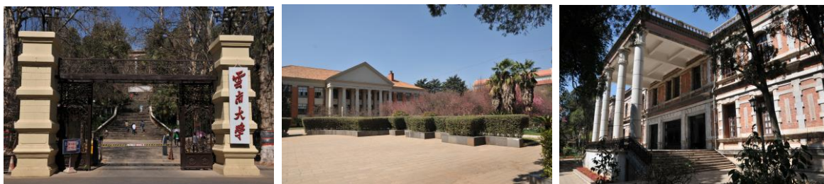
Yunnan University (conference venue) and its main buildings on campus.