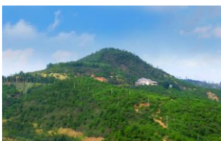
The Maotian Mountain

22 August. Delegates depart, or continue their own tourist activities. Maps and other tourist information about the Kunming Changshui International Airport, shopping, sightseeing, and transportation in Kunming, will be available during the meeting.