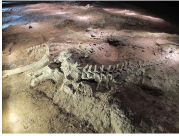
The dinosaur valley in Lufeng