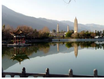
The Chongsheng Temple in Dali