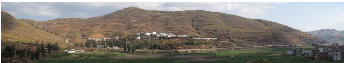
The Ordovician section at Haidong, Dali, western Yunnan

Day 2 (Aug. 17): Qūjing to Dali, western Yunnan (about 450 km, freeway). On the way, all delegates will be invited to visit the extensive Mesozoic red deposits of terrestrial facies, and the famous 'Dinosaur Valley' where over a hundred skeletons of the Middle Jurassic Lufengosaurus in association with some other prosauropoda dinosaurs were buried and are being exhibited in situ . Overnight in the Dali Ancient City.