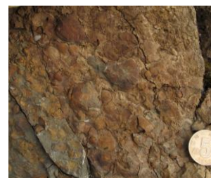
Fossiliferous bed at Laojianshan